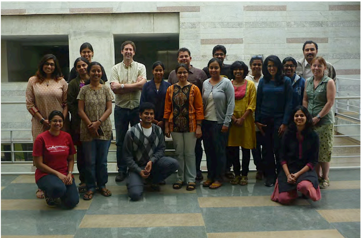
Figure 7: Participants of the bioacoustics workshop held by the University of Washington, Woods Hole Oceanographic Institution, National Centre for Biological Sciences (NCBS) and Wildlife Conservation Society Wildlife Programme in 2014.