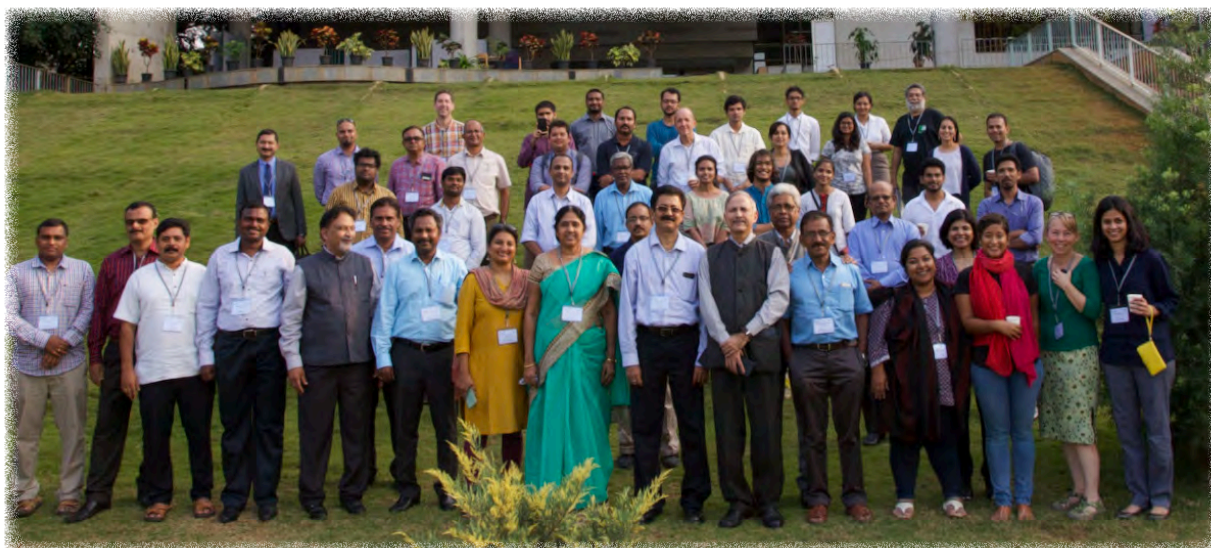
Figure 8: Marine Mammal Symposium participants at NCBS in 2018

our team recorded 52 sightings of 12 different cetacean species, including blue whales, sperm whales, spinner dolphins, and killer whales. Most sightings occurred in the southern Bay, with fewer observed in the central and northern regions. However, better visibility and calmer seas in the south may have contributed to this pattern, so it remains uncertain whether these differences reflect true variations in cetacean distribution (Wijesekara et al. 2016, Figure 6). Yet even this exploratory survey hinted at something intriguing—a possibly distinct and smaller cetacean community inhabiting the northern Bay (Shroyer & Mahadevan 2013). Combining more sighting data with ocean measurements will help