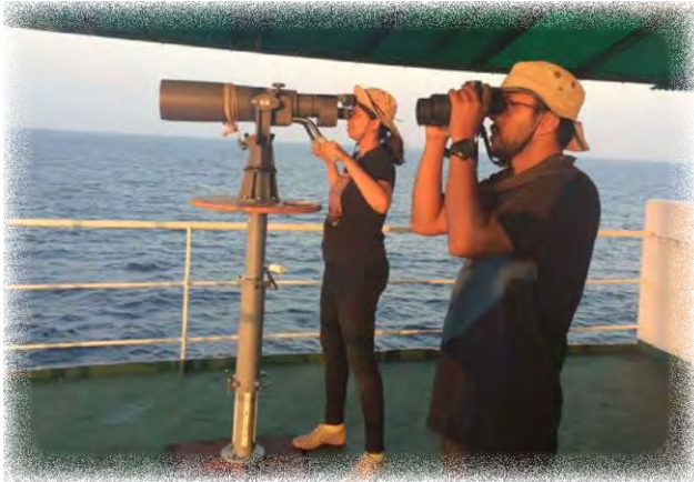
Figure 10: Reproduced from Srinivasan et al. 2018, Observers using “big-eye” and handheld binoculars to survey for cetaceans in offshore Kerala waters.

us understand how monsoons affect where and when cetaceans are found in this region.