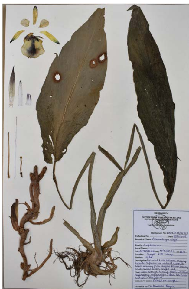
Herbarium specimen of Boesenbergia kingii (BRICIBSD/M322).

both side; bracteoles lanceolate, one each per flower 0.4–0.7 × 2–3.7 cm, apex acute, white glabrous; calyx tubular, 0.8 × 1.7 cm translucent white glabrous, apex dentate. Flower tube, 8–10 cm, white glabrous exterior and interior; corolla lobes (dorsal and lateral) oblong, 3.5 × 0.7 cm, creamy-white, apex obtuse or round, margin slightly involute, faintly pink, glabrous; Labellum saccate, elongate, 3.5 × 4.5 cm, lip white creamy, centre of throat bright red, with white dots, margin undulate, apex entire; lateral staminodes 1.3 × 1.5 cm creamy white, obovate. Stamen 3 cm, glabrous, white with a tinge of red filament base; anther basifixed, slightly bilobed. Ovary, white, 1 × 0.3 cm, trilocular with axile placentation, glabrous. Style, 11 cm, filiform; stigma elongate, white, ostiole vertical,