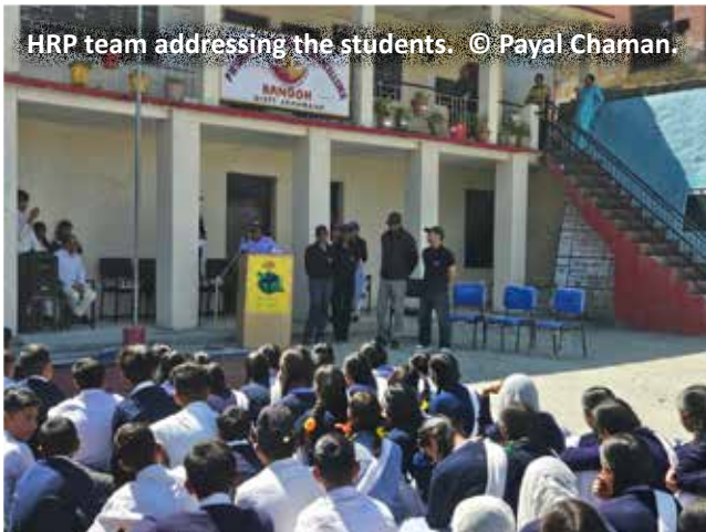
HRP team addressing the students.