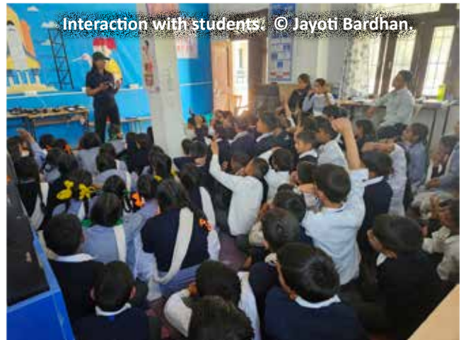
Interaction with students.