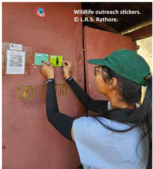
Wildlife outreach stickers.