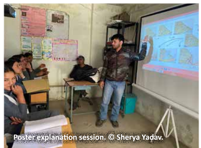
Poster explanation session.

importance of native species conservation. In the end, all the efforts felt valuable.