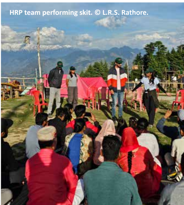
HRP team performing skit.

This year, the crowd was much larger, with more than 240 students and 15+ teachers present. Explaining the importance of native plantation to such a large audience was challenging, but the students listened very quietly and attentively. Since the classes were small and the number of students was high, we had to take four separate interaction sessions throughout the day. It was a hectic day, but we believe the students understood the project and the