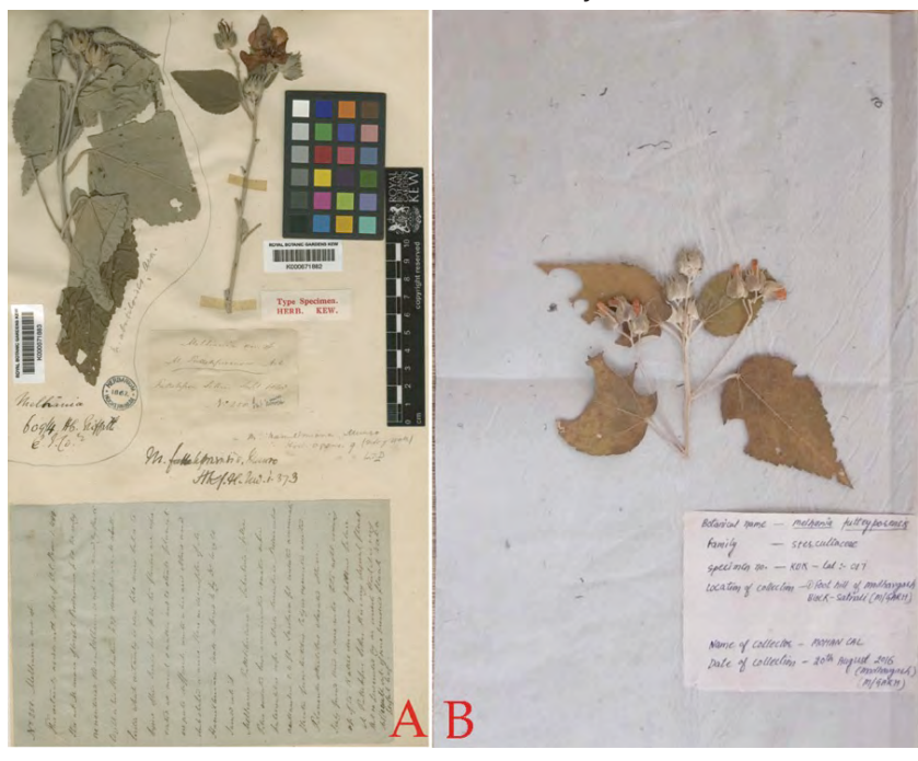
A - Image of type material; B - Image of Collected specimen

A small sub-shrub, 40–70 cm high, coarsely pubescent, stems terete. Leaves simple, 5-7-costate, ovate or broadly ovate-lanceolate, ca. 15×7