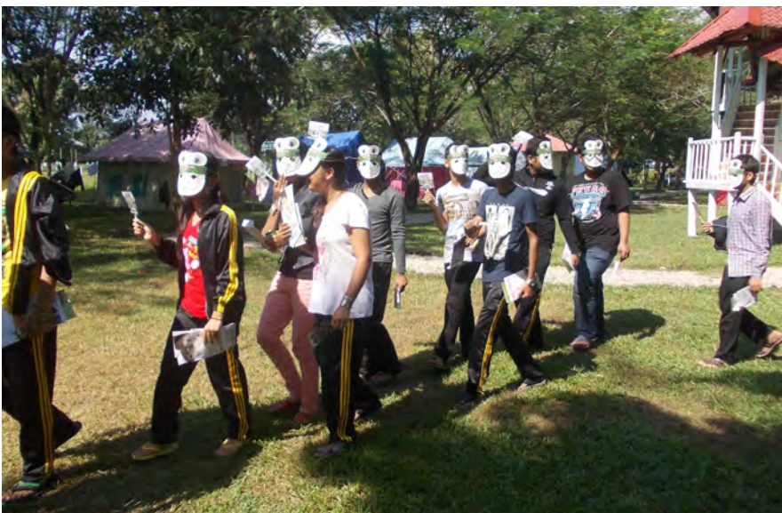
Rally to save Rhino

Though the programme came to an end, the interaction continued for a longer time. They enjoyed the programme and appreciated a lot as the whole concept of the programme was very new to them. The teachers including the Principal appreciated the method and tools used for the entire programme and thanked specially the 'ZOO' and its sponsors. This made me really feel proud for being able to conduct such successful programme which was only possible for me due to 'ZOO' and the uniqueness of their entire module, training process and Trainers which is worth to mention. My sincere thanks are due to Ocean Park Conservation Foundation, for sponsoring ZOO's Rhino education project.