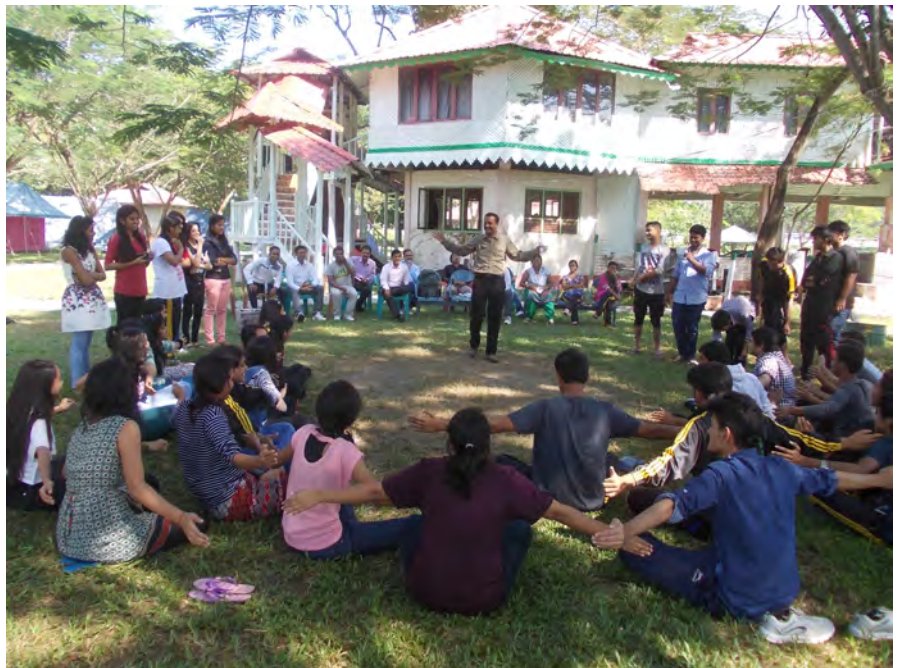
Rhino outdoor education programme at Gorumara National Park

In this session the description of all five species of Rhino was covered along with the differences, characteristics and patterns. The taxonomy was taught to them without much difficulty. The students as well the teachers showed keen interest to know more about Rhino. It was an interesting interactive programme.