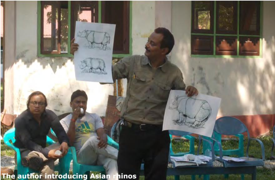
The author introducing Asian rhinos