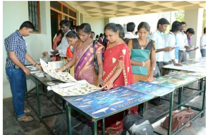
Display of the publications and educational packages of ZOO