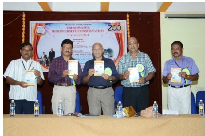
Release of the workshop manual on "Freshwater Biodiversity Conservation"