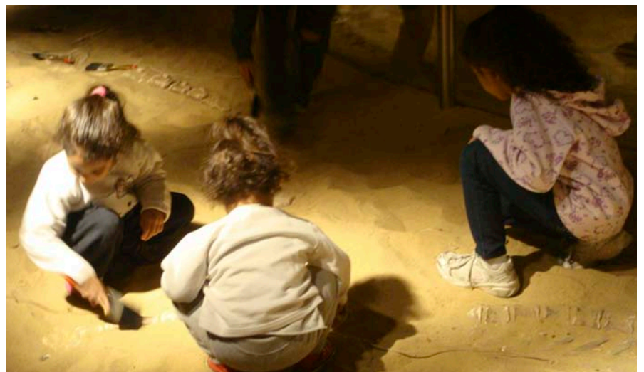
Kids play archeologist at dinosaur display in the Temaikén Zoo