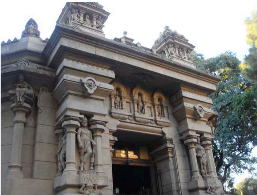
Elephant house at Buenos Aires Zoo

Buenos Aires Zoo reminded me a lot of our Mysore Zoo in India. Even some of the constructions were just the same, like the bandstand where a live band used to entertain visitors to the zoo on Sundays.