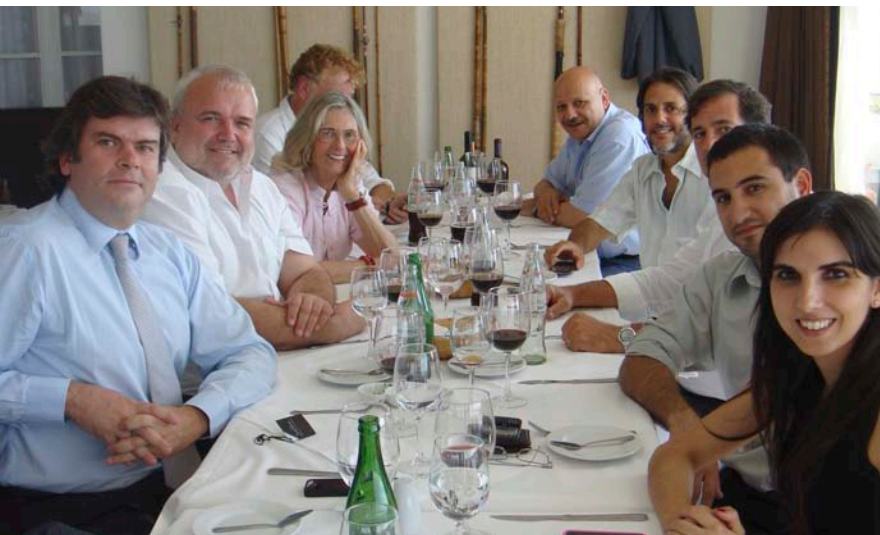
Argentine culture 5 hour lunches make for great camaraderie

Argentina is known for its outstanding meat and we probably overdosed on it as it is the best in the world and we ate steak every night. The last day was a tour of the entire Teimakin Zoo where we were so happy to see such a beautifully organized and executed zoo. We were also happy to go some distance away to the zoo's off-site breeding and research centre. The following day we went our separate ways ... home, other meetings and other tours. It was a great way to do business while enjoying every minute. Many thanks to our Argentine hosts.