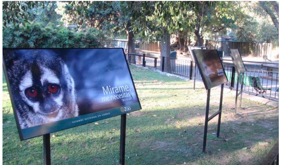
New educational signage inaugurated during WAZA visit to Buenos Aires Zoo