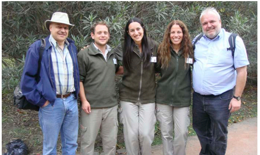
WAZA President and Executive Officer with Temaikén staff