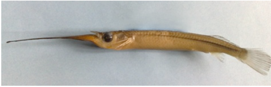
Fig. 3. Zenarchopterus striga (Female specimen) Scale 1cm= 1.23 (Accession No. 454, deposited in the Zoology Museum of Maharaja's College, Ernakulam, Kerala).