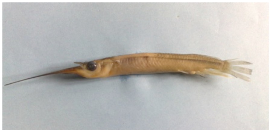
Fig.2 Zenarchopterus striga (Male specimen) Scale 1cm= 1.15 (Accession No. F. 8474, deposited in the Southern Regional Centre, Zoological Survey of India, Chennai).

at Brahmamangalam, Kottayam district, Kerala (Fig 1) during an ichthyofaunal survey on 12 th May 2010. Fishes were collected using a cast net and preserved in 10% formalin. The biometric characters are provided in Tables 1, 2 & 3. The identification of the specimens were carried out using Day (1878), Talwar and Jhingran (1991), Jayaram (1999) and Nelson (2006) and subsequently confirmed by scientists at the Zoological Survey of India (ZSI), Chennai. The specimens have been deposited with the accession number F.8474.