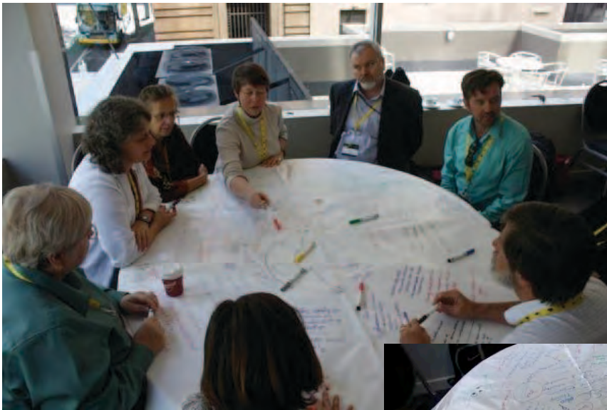
Left: Participants discussing topics using the new "World Cafe" activity to focus thinking and insure all ideas are captured.