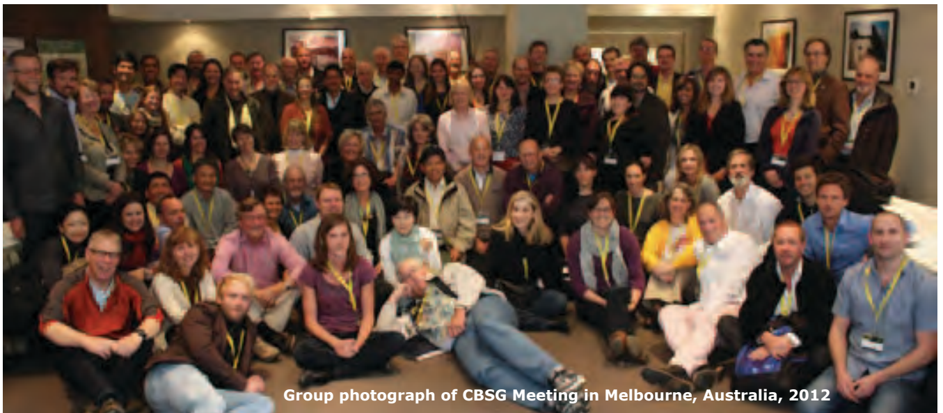
Group photograph of CBSG Meeting in Melbourne, Australia, 2012