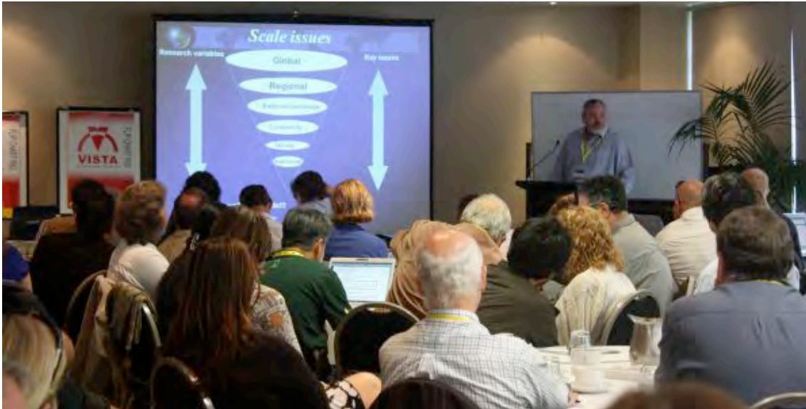
Above: CBSG always invites a range of good speakers to give an up-to-date review of what's happening in the world of wildlife and environment.