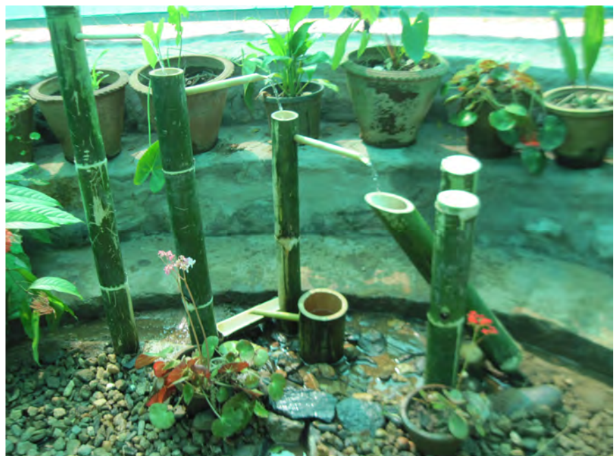
3. Innovative Bamboo water Fountain