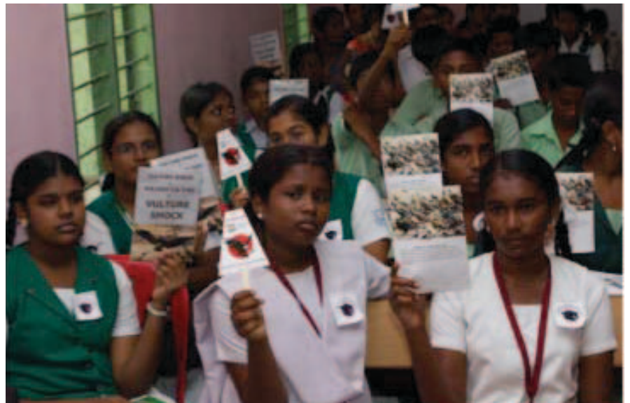
Posing with vulture education kits