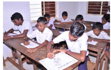
Vulture pictures drawn on the black board and students in drawing competition