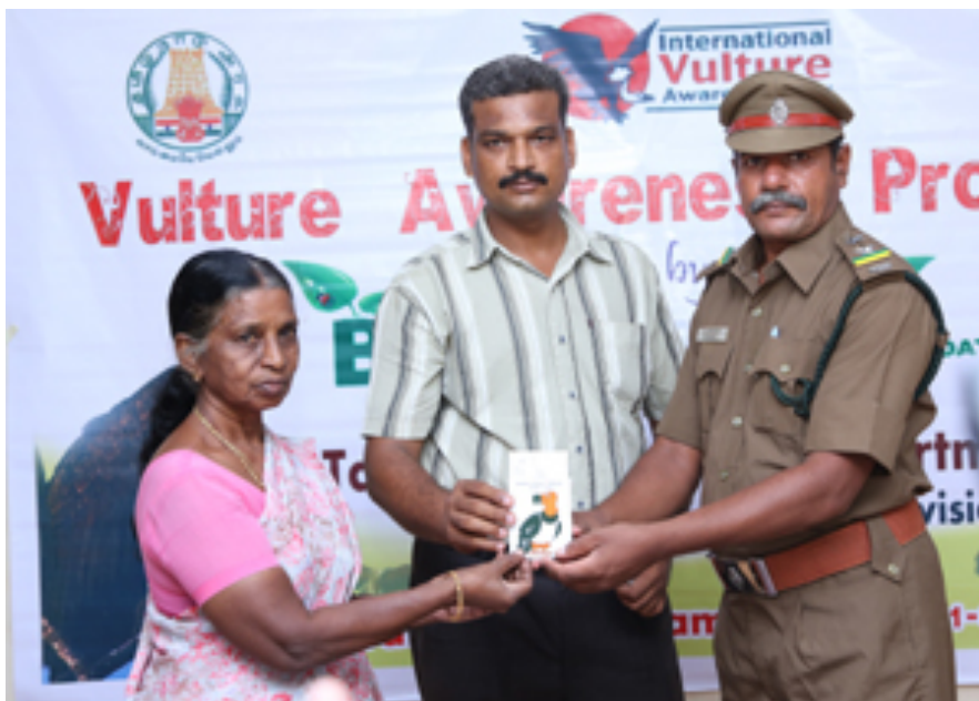
Vulture flash card given to the teachers