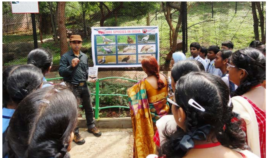
Participants were briefed about vultures in front of zoo's vulture enclosure

programme. The response from the participants was overwhelming and all of them performed very well in the competitions. The event ended with prize distribution and closing speech by the zoo curator. Participation certificates were also distributed to all