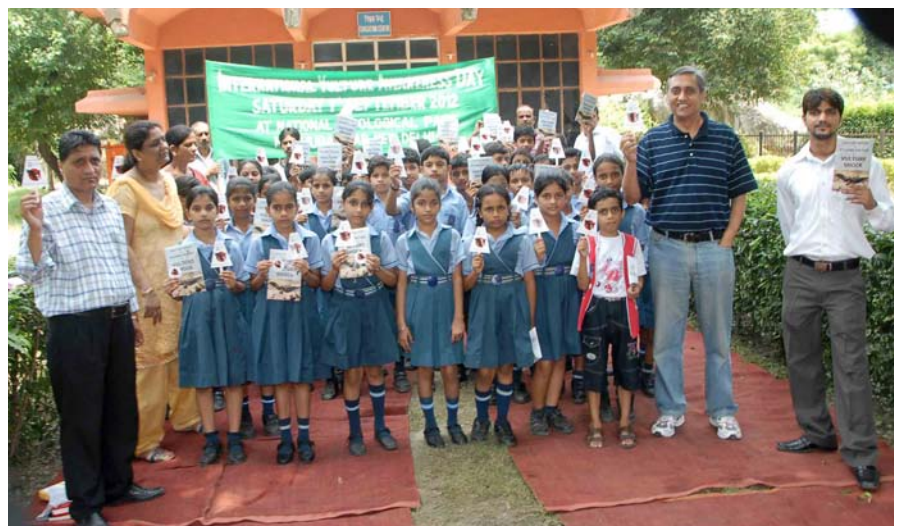
The Zoo team with the students and teachers