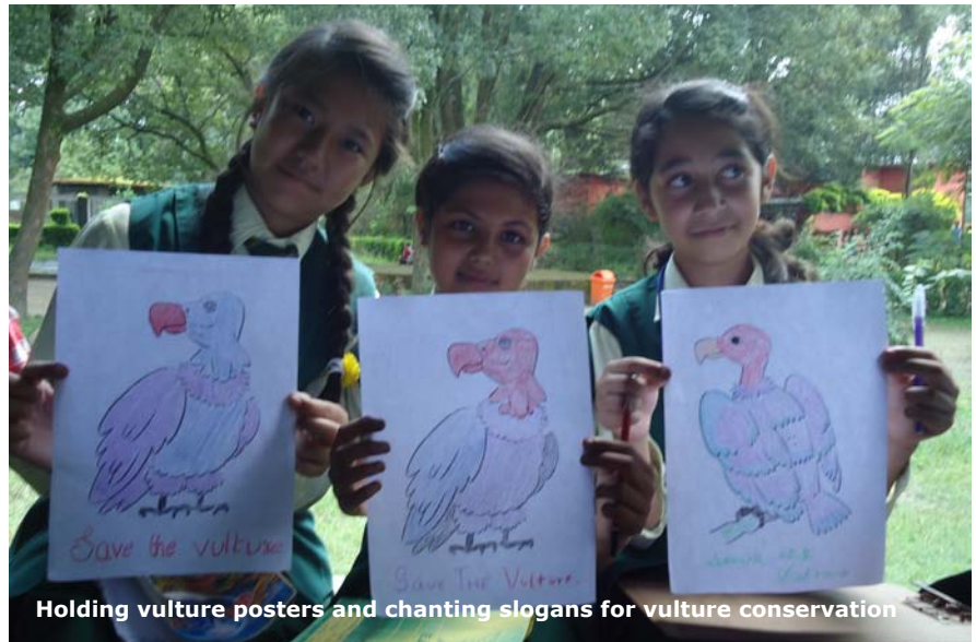
Holding vulture posters and chanting slogans for vulture conservation

Central Zoo celebrated the International Vulture Awareness Day on 1st September, 2012 to create awareness about vanishing vultures. On the occasion various programs were organized among zoo visitors and Friends of Zoo (FOZ) members. More than 200 FOZ members from different schools participated in the program, which comprises of presentation along