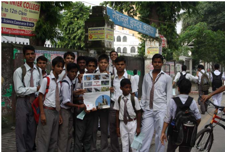
Students made aware of vulture conservation