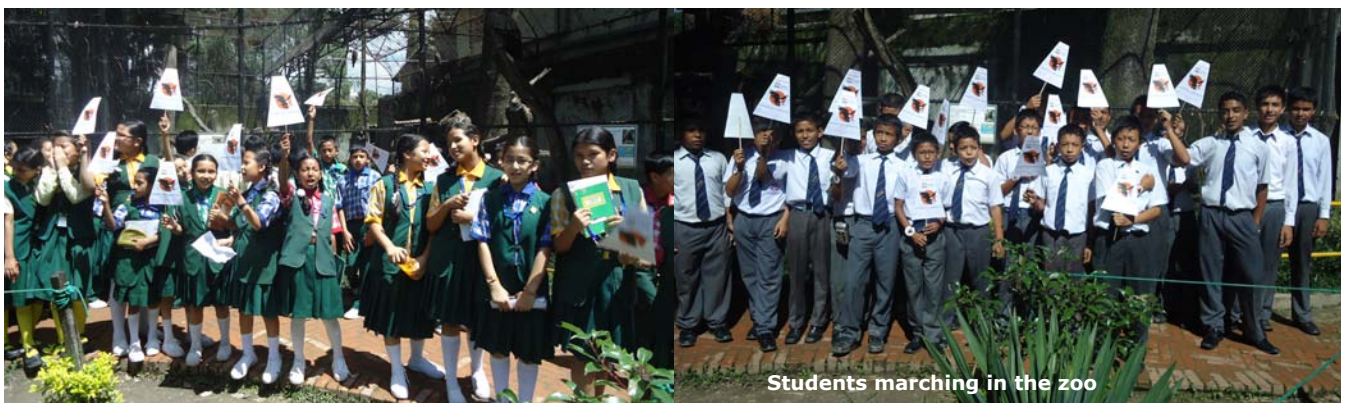
Students marching in the zoo