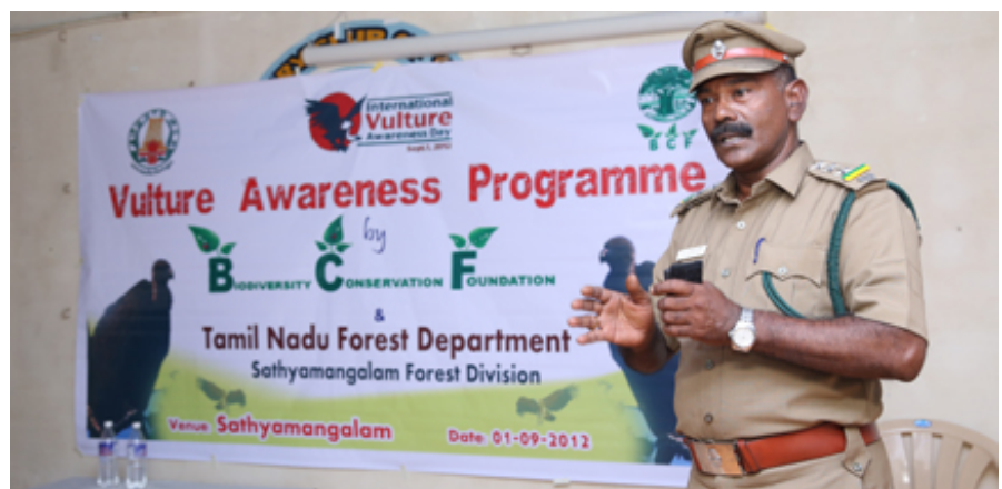
TNFD official sharing his experiences on vultures

Sathyamangalam town. Students and teachers appreciated our efforts and expressed their happiness to see pictures/photos of this amazing species, which they can otherwise see only through television shows. Students have acquired a sense of accountability to protect the ecosystem and avoid eco-toxicological habitats of human. Inspired by these enthusiastic students, BCF extended the awareness program to another two tribal villages at Thengumaragada and Kulithuraipatti. BCF has made tribal villagers to understand the ecological importance of vultures as scavengers and created awareness among them on the impact of diclofenac and measures to avoid its use to conserve vulture and their habitat for future generation.