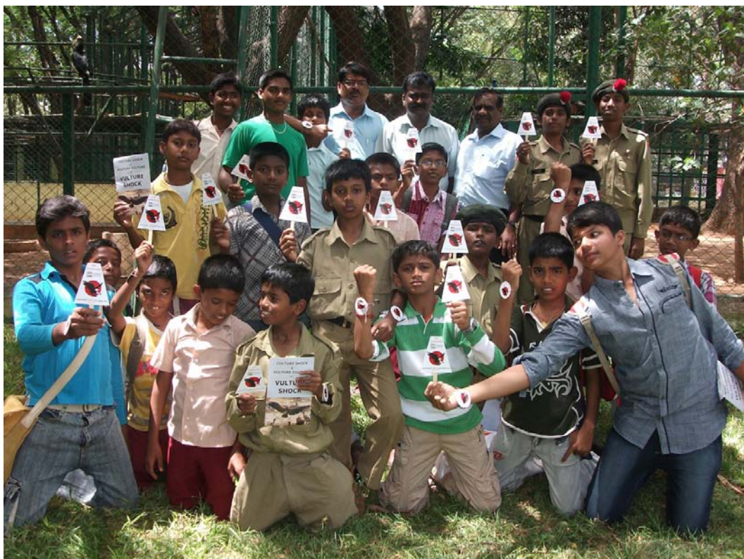
Students who participated in the event with their teacher and coordinator