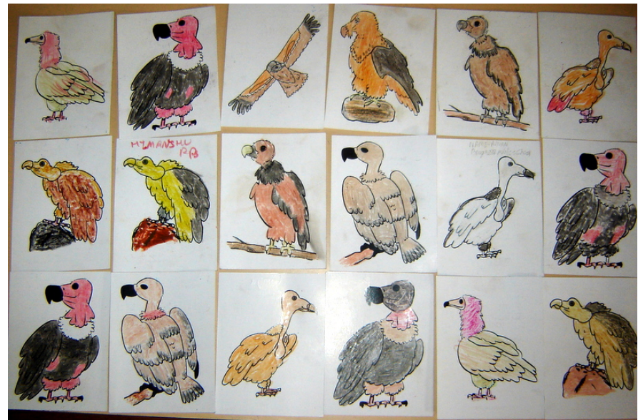
The kids coloured the vulture cards and it displayed in zoo bulletin board