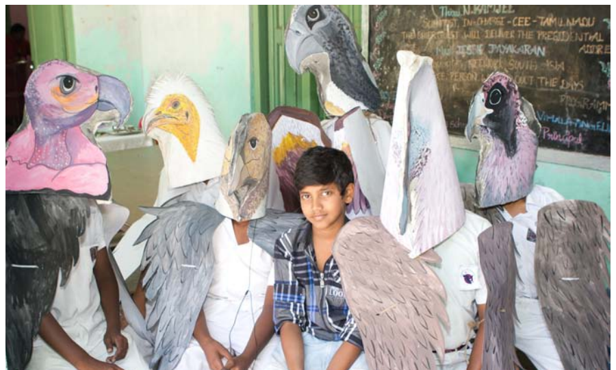
Different vulture masks developed for vulture culture programme