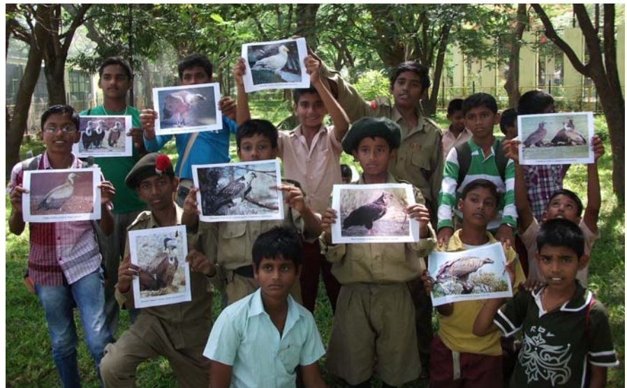
Municipal school students with nine species of Indian vulture posters

Then moved on to the ecological significance of vultures and they are