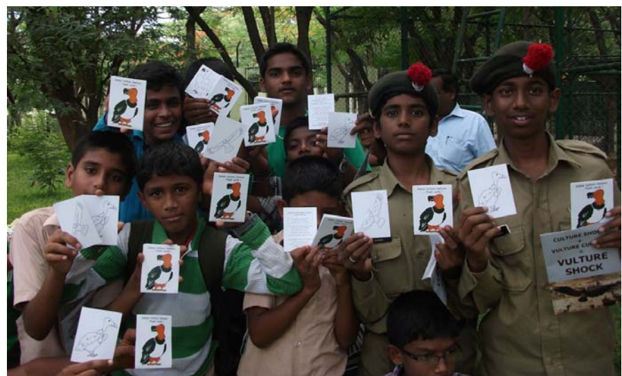
Exploring vulture flash cards to know about vulture kinds and the poem