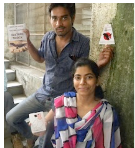
Wildlife students with vulture kits

not only spoke about vultures but also about cattle rearing trend, culture