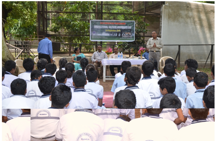
Students briefed about vultures and its conservation by the resource persons

The programme went on with the education materials supplied by the Zoo Outreach Organisation specifically on International Vulture Awareness Day celebration. Students read the short poems regarding each Indian vulture species. There was a short