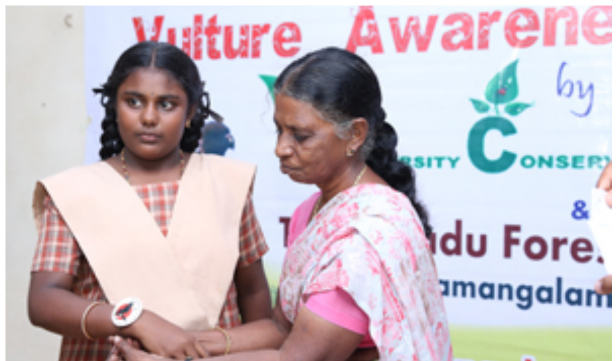
One of the teachers tying rakhi to his student