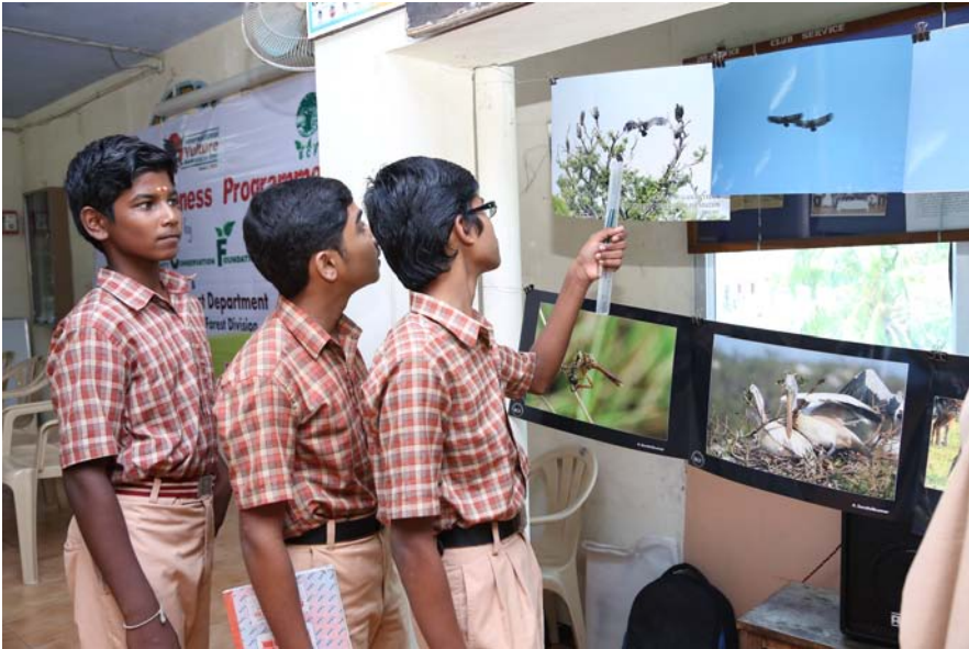
Students looking at the exhibition gallery