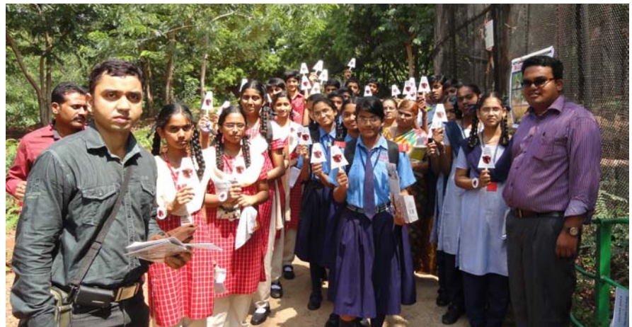
Vulture conservation rally conducted at the zoo by carrying placard

The students watched a thought-provoking documentary on Vulture Conservation in India. Later, power point presentation emphasizing different species of vultures, their distribution, ecological importance and conservation status was given in an attempt to imbibe useful information to the students about these endangered creatures in an interactive manner. Later activity to identify and colour the different species of vultures in India was carried out using the flash cards