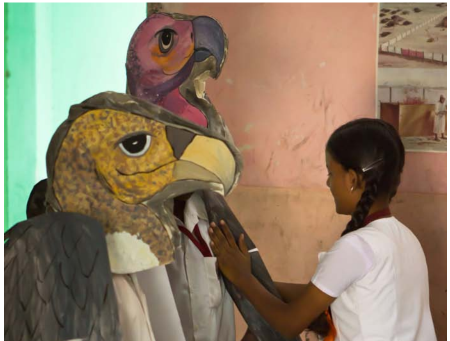
Students with very creative vulture masks during cultural programme