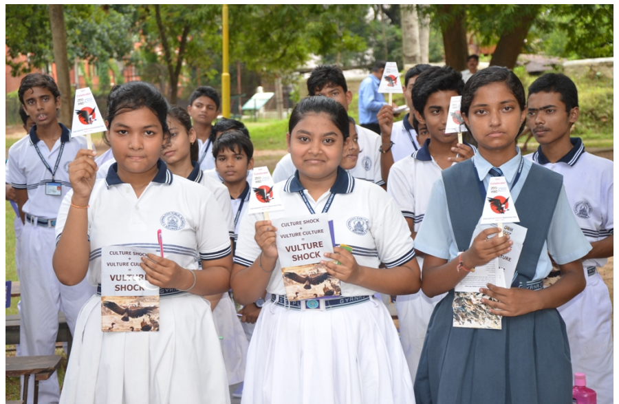
The wards with placard and vulture booklet

play with the vulture information cards. One volunteer had to show the card and the others need to tell the name of the vulture without seeing the backside text of the card. They also tied the 'rakhi' to their friends especially designed for the International Vulture Awareness Day. The students extended their hands towards the conservation of the vulture with the flash card provided in the education kit. Besides, a poem, written in Odia