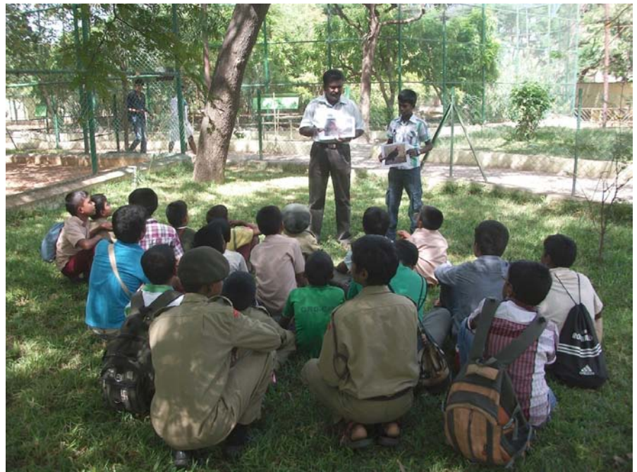
ZOO educator presents detailed information about Indian vulture species

Subsequent to this, ZOO's vulture kits were distributed to all the students. First of all, VULTURE SHOCK booklet was used. The students were asked to go through page by page and few of them read loudly to other students hear. Then they took the Indian Vulture Venture ...Flash Cards. They explored all the nine species of