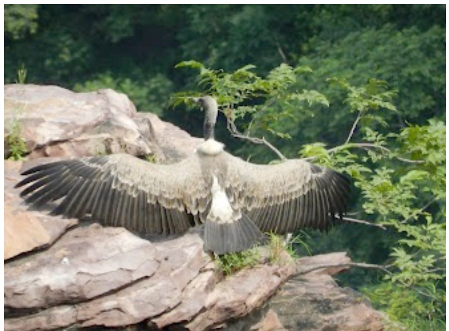
Vultures at Geparnath, one of the safest breeding site