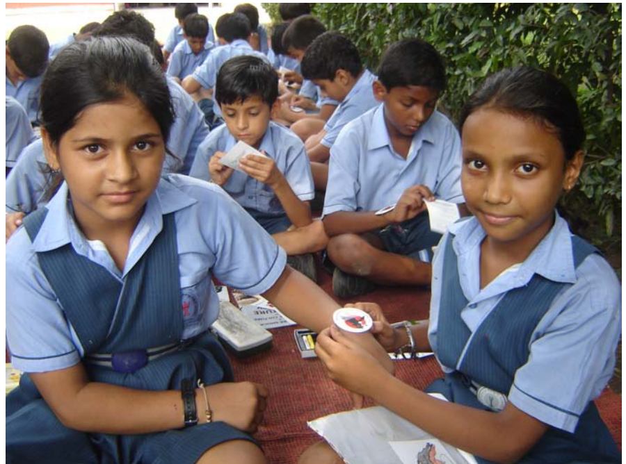
Tying vulture rakhi and taking oath to save vultures