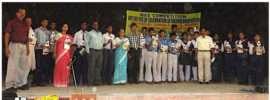
The organiser, school students and teachers with ZOO's vulture kits

At the end the materials received from the Zoo Outreach Organization was used and distributed among students and teachers.