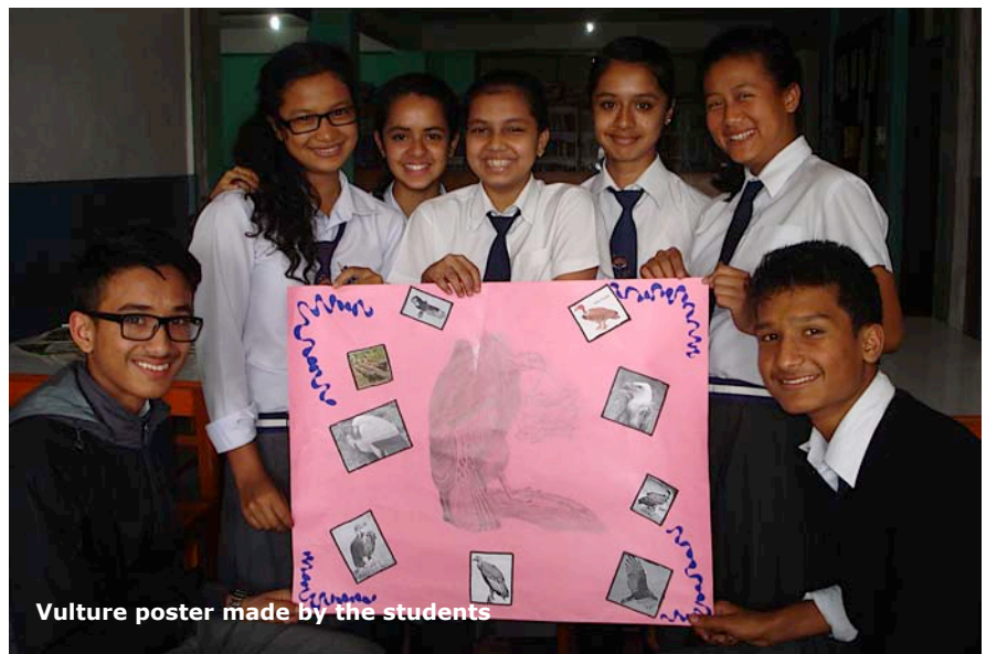
Vulture poster made by the students

with the talk program on Vultures. FOZ members took out a rally around the Zoo holding display cards and chanting slogans for vulture conservation. Likewise colouring and painting were done by FOZ members. To create awareness about vultures talk program was also delivered among visitors in front of the vulture enclosure. Similarly the talk program