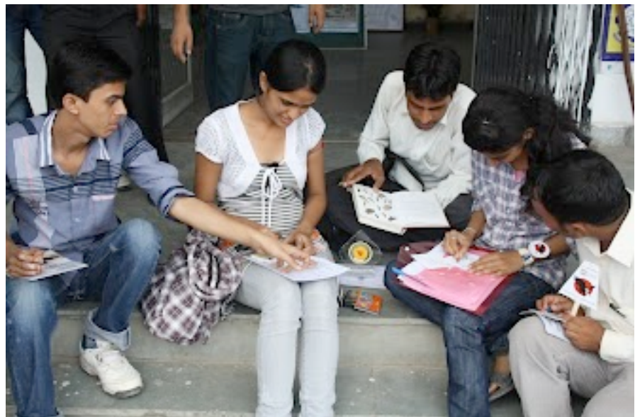
Participants colouring the vulture flash cards

this University and proposal has been sent to Central Government for approval. He in his speech also added conservation of native species is more beneficial than introduction of any kind of species".