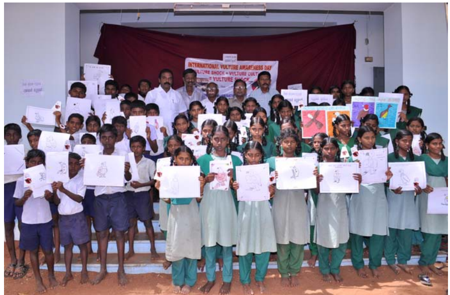
Students who participated in vulture drawing with their pictures