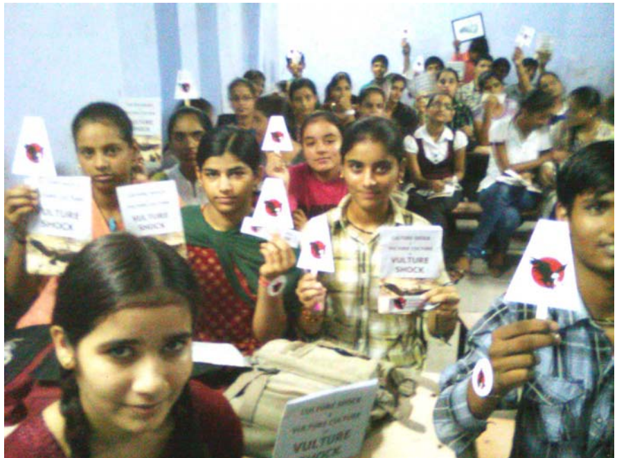
Savitri Sikha Nikaten students with vulture kits

The students were told about the Jorbeer area which is a prominent city of Thar Desert, having all the traits of being known as 'The capital of Desert'. The Jorbeer region is spread over an area of 20-25 km. The city has a vulture link and its nearby desert villages are well known for avian fauna mostly for Gyps vulture species in winter and for other birds throughout the year. Besides residence vultures, many migratory vultures start arriving here during September and return back to their original place by February and March. In the last 7 years vulture population has been increasing in Jorbeer dead animal dumping site.