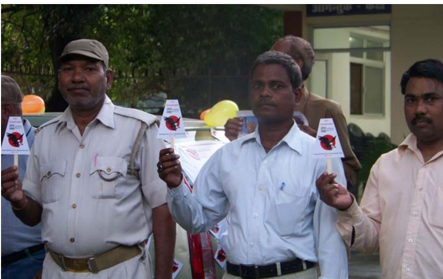
People from all walks of life come forward to save vultures