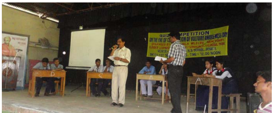
Four schools of Bishalgarh participating in vulture quiz competition