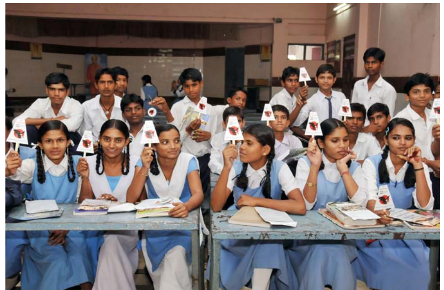
Students rejoicing with Vulture kits