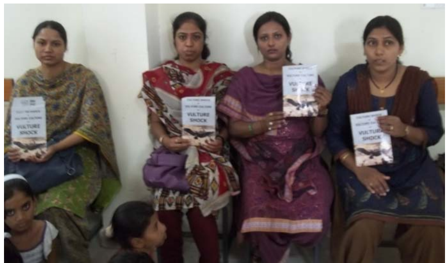
Teachers provided with vulture kits to have future programmes on vultures