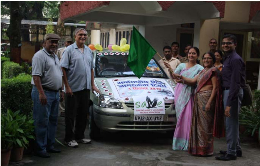
Well decorated vulture awareness car flag off by Vice Chancellor and his wife