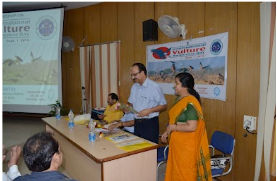
Chief Guest and other dignitaries at the vulture workshop