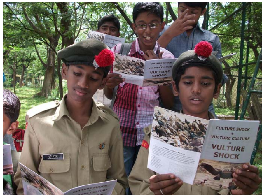
Going through the information on the vulture booklets