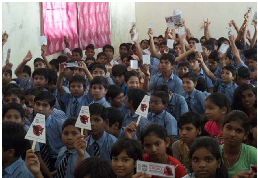
Enthusiastic students who are having vulture materials

teacher were benefited by this session and encouraged to have more such programme based on species conservation.