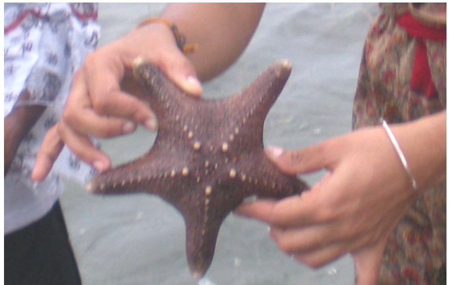
Students familiarizing with marine organisms at Gulf of Mannar Biosphere Reserve- holothurian and starfish