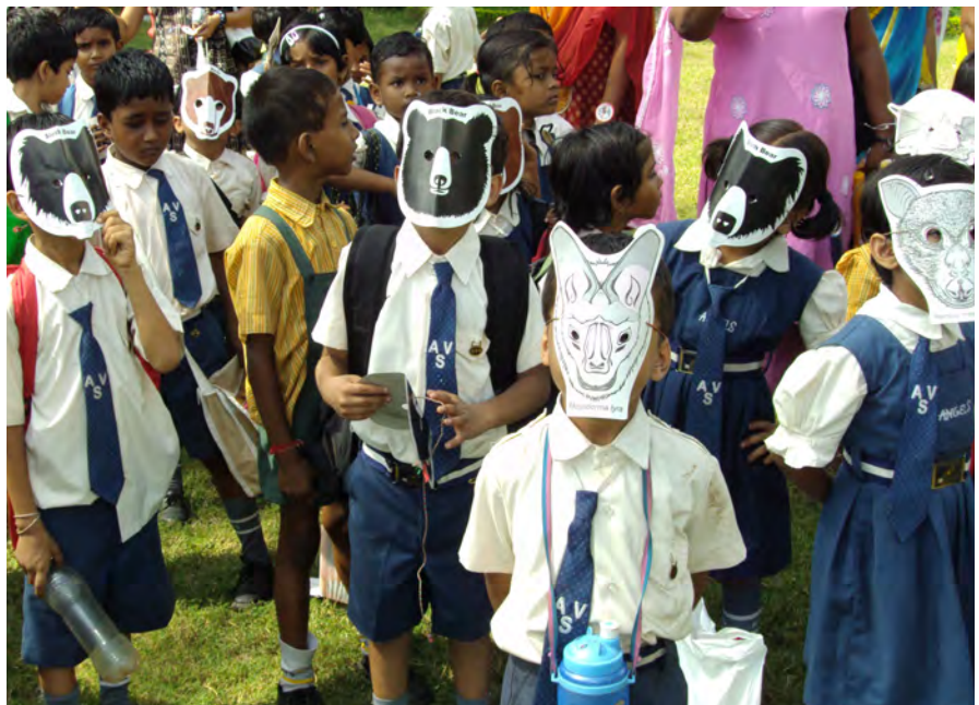
Kids rejoicing with different animal mask