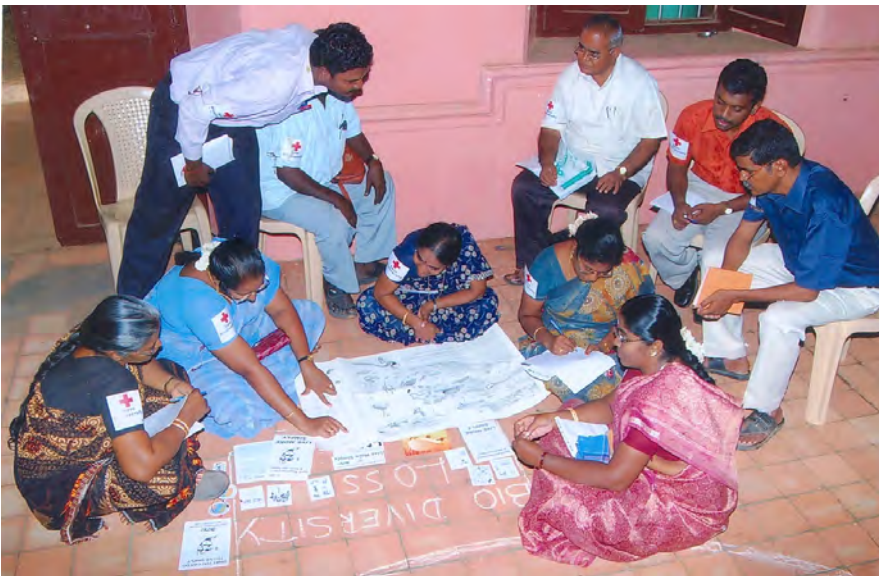
Another group works on illustration depicting biodiversity loss