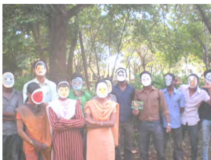
Participants who performed the drama