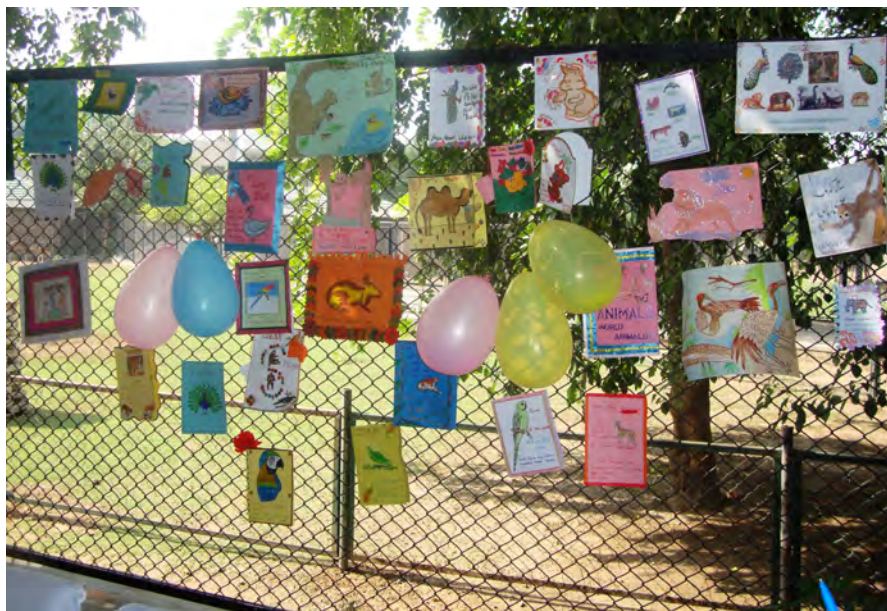
Animal enclosure decorated with children's drawings