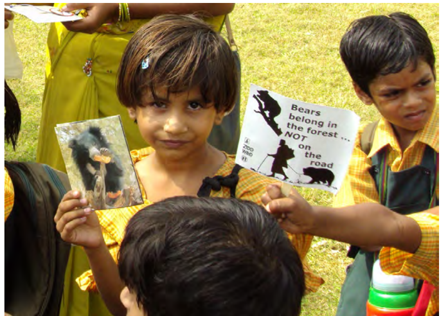
Pledging to stop bears on the road