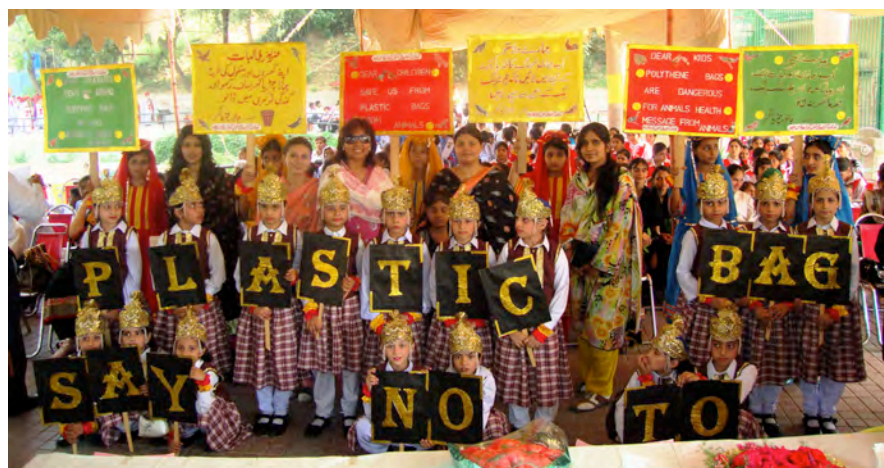
Students say no to plastic bags