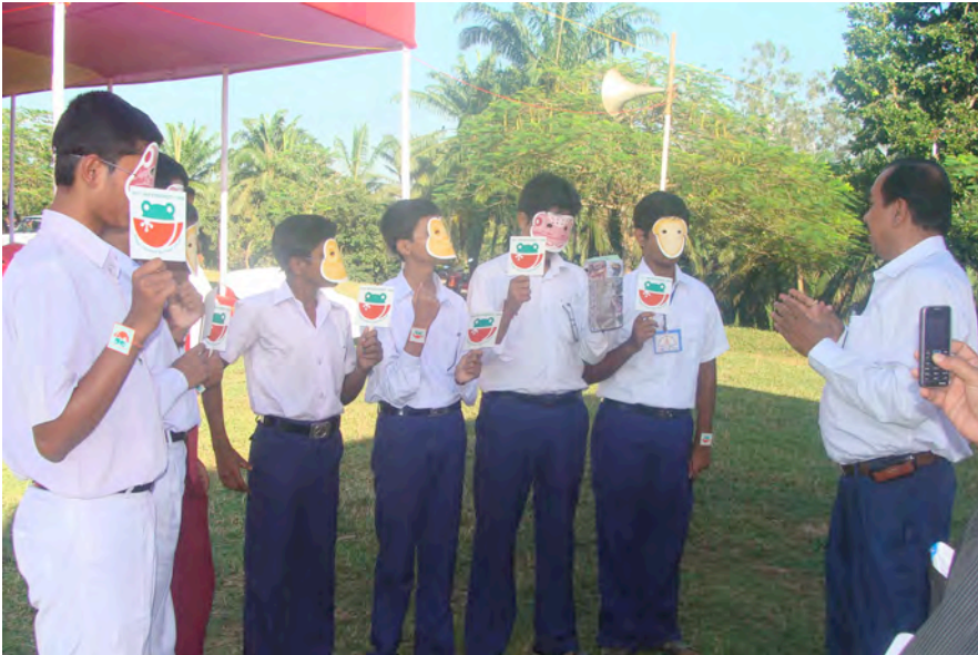
Explaining and demonstrating ZOO educational materials

was held on 7-10-10 at the same school and 32 students participated. Bicycle race for boys and girls and Tug of war was organized on 1-11-10. Procession was held on 3-11-10 and 8 Eco Development Committees participated.