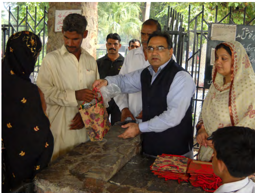
Chief guest exchanges paper bags for plastic bags