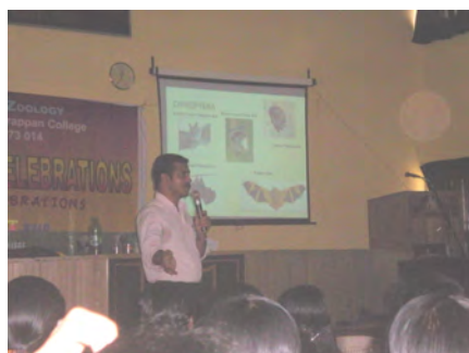
Talk on biodiversity values