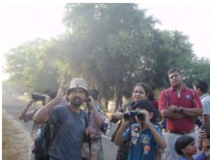
Guiding participants on Bird watching