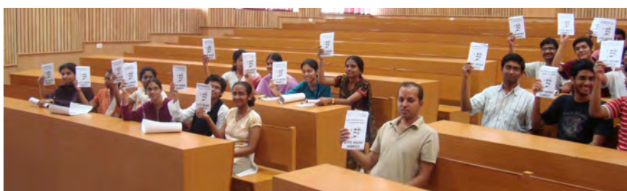
Participants of various streams with the ZOO education kits