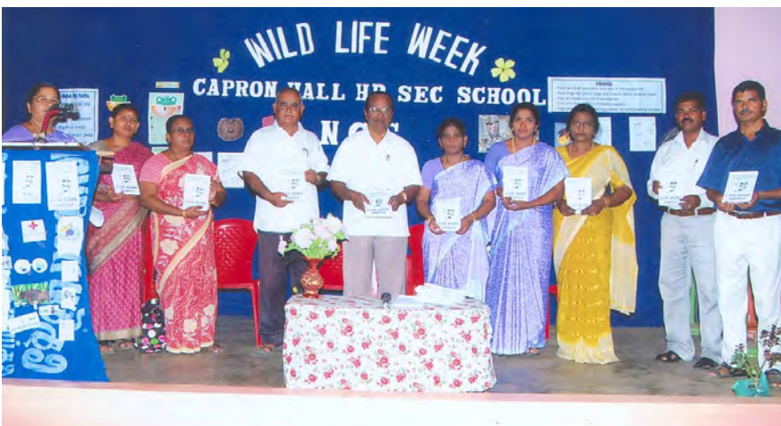
Introduction of Live More Simply packet