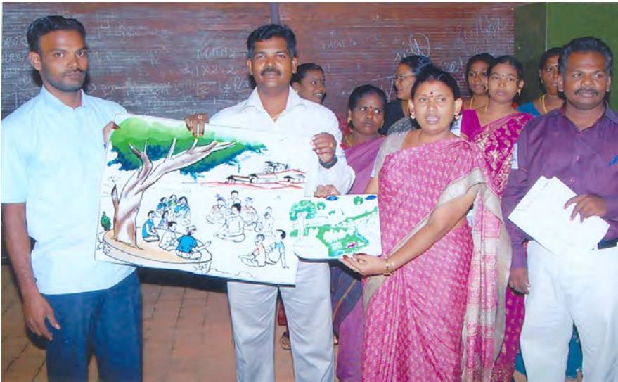
Teacher's group explaining illustration on Climate Change mitigation

Editor's Note: We apologise for delaying these education reports. We had full issues of other important articles and somehow postponed these. Perhaps readers can benefit by getting ideas for upcoming education events, such as World Environment Day June 5.