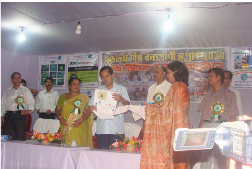
Hon'ble Forest Minister releasing Hoolock Gibbon posters