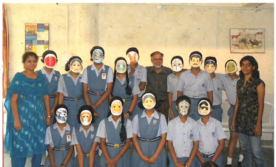
Snake Friends with Climate Change masks

Wildlife Week 2010 was celebrated unlike previous year at Sepahijala involving the school students/public, panchayats, eco-development committees with following events and activities: Pravat Feri processions were held on 4 October 2010 in 6 panchatyats. About 3000 students took part in this procession. A talk on wildlife conservation was organized at Baidhyardighi High School on 5-10-10 for 500 students and teachers. And there was great impact and awareness. Division level debate competition was held in the same school on the subject- Is wildlife conservation compatible to development? Division level quiz competition was held on 6-10-10 at Charilam HS School and 40 students participated. Sit and Draw competition