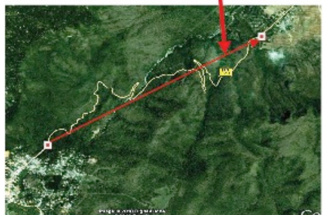
Location map indicating the study area and zoomed in images of forest

*Research Fellow, Dhole Ecology and conservation Project, Wildlife Institute of India, Dehradun 248001 Email: selvan@wii.gov.in