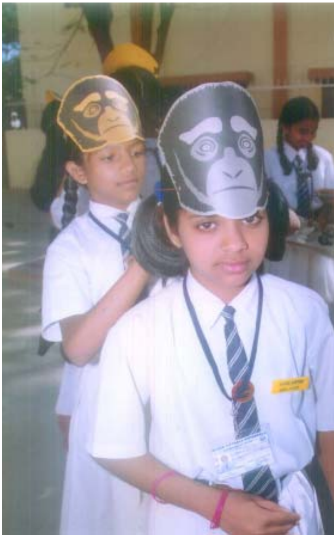
Primates in peril - Students with masks.