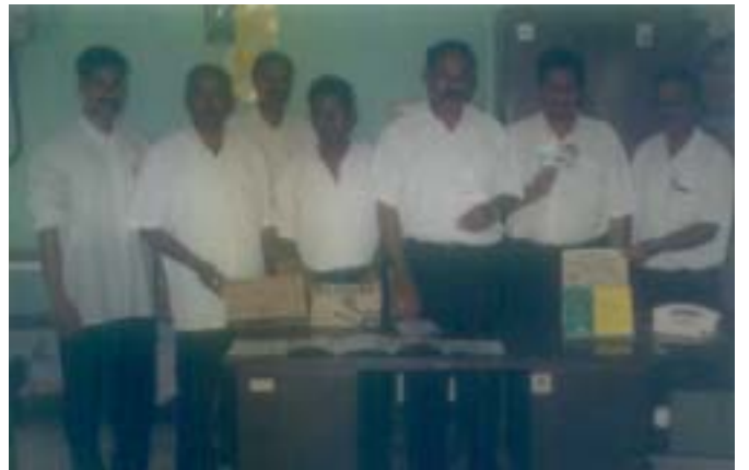
50 th Wildlife Week celebration