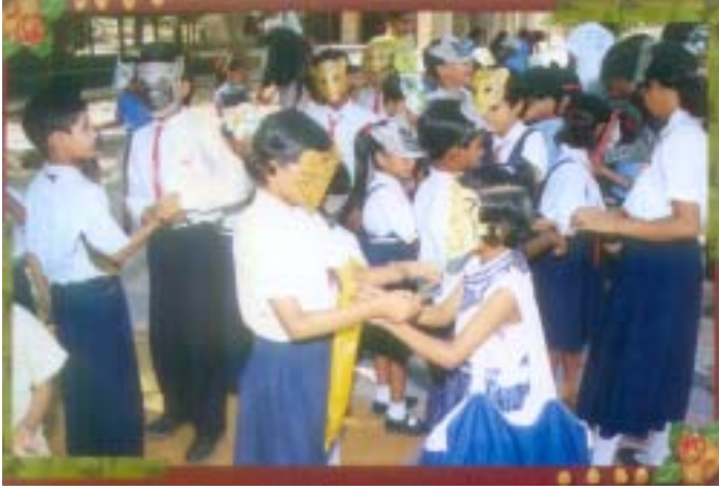
Students tying Rakhies and taking oath