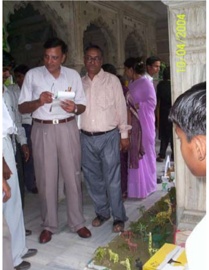
Guest of honour