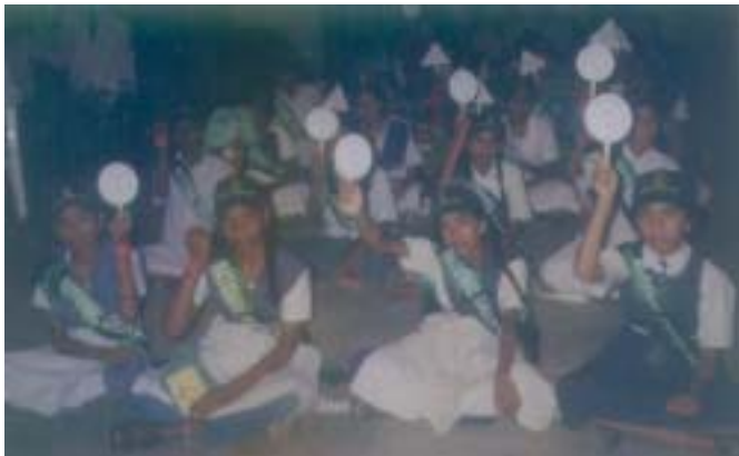
Students holding educational materials during the seminar