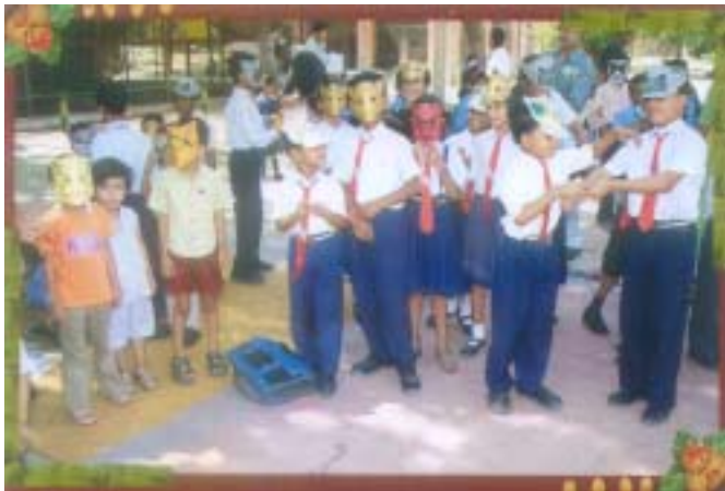
Students Playing game that they are Wild animals...