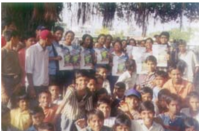
The First year undergraduate students of M.S.University with the local children who participated in the Bat Education program