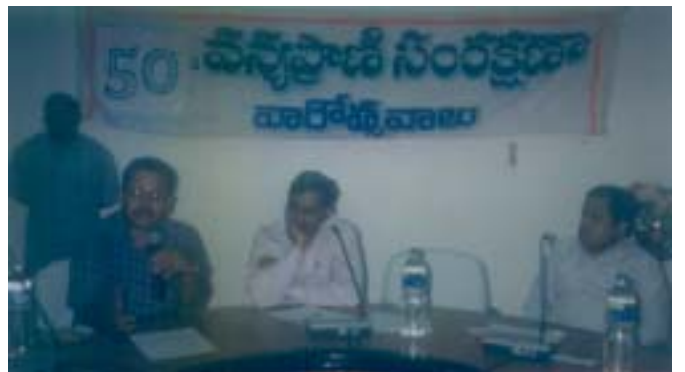
Conservator of Forests, Wildlife week celebrations, A.P. Forest Department