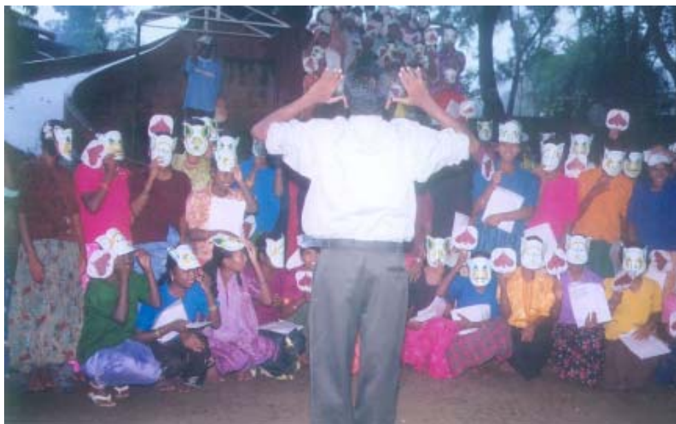
Outdoor programme about bats