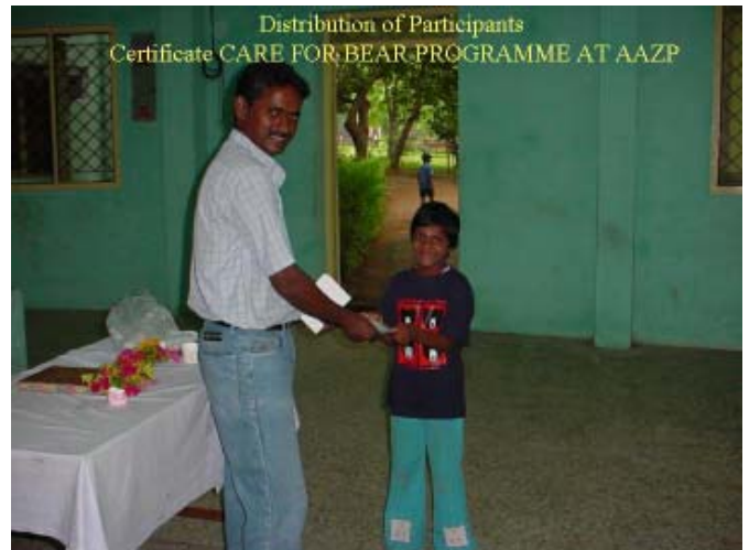
Distribution of participants certificate