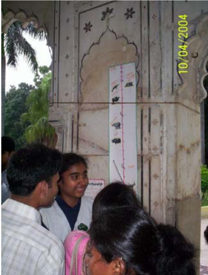
Joy of learning