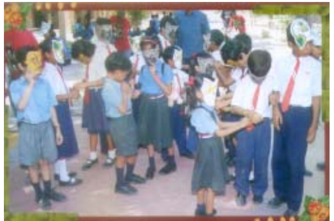
Children tying Rakhies