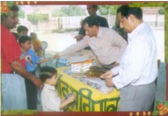
Wildlife warden distributing literature