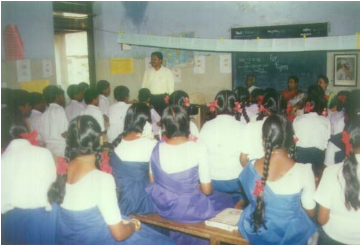
A scene from class room

* Corporation Middle School, Pappanaikkan Palayam, Coimbatore 641 037, TN