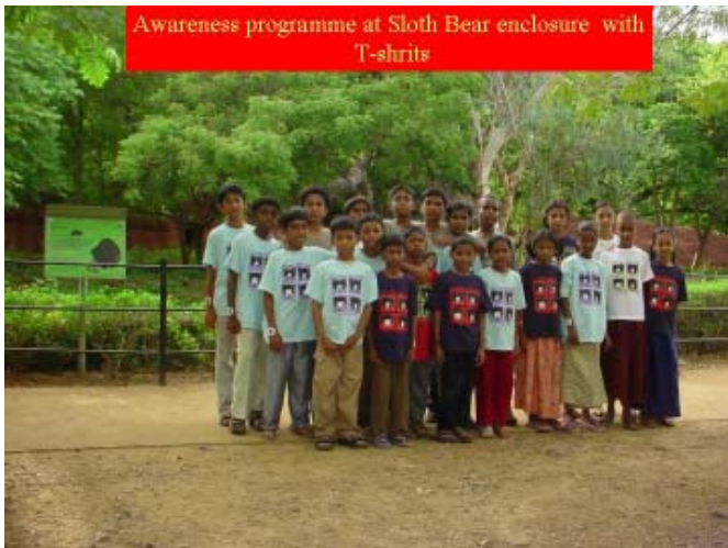
Awareness programme at Sloth Bear enclosure with T-shirts