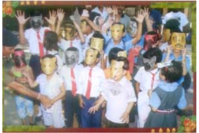
Students playing a game with the masks on

* Wildlife Warden, Zoo Bikaner, Bikaner 334 001 Rajasthan