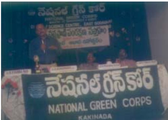
Students & Teachers of different schools