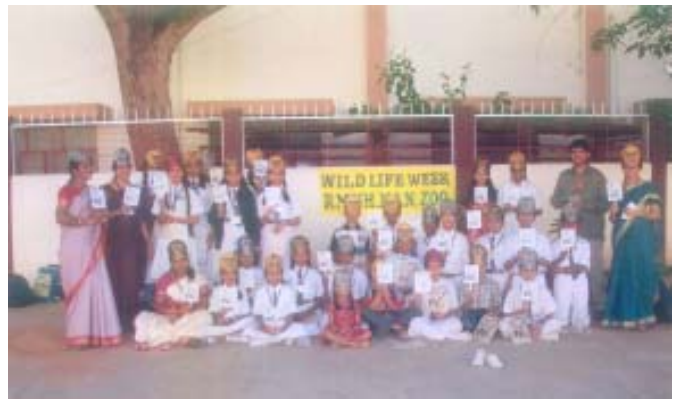
RMNH Education programme on Bats