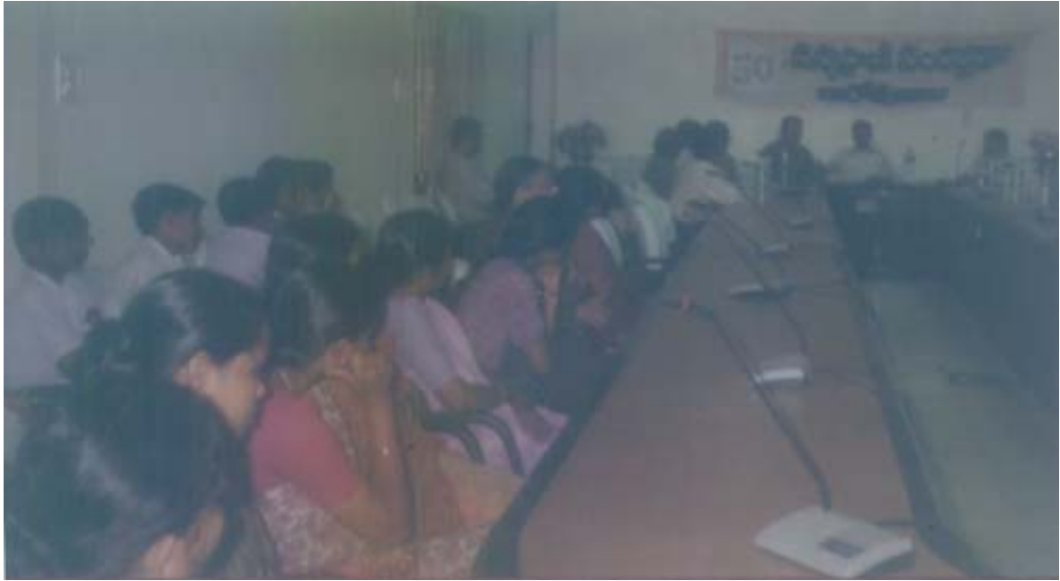
Forest Department Staff & Students of various schools