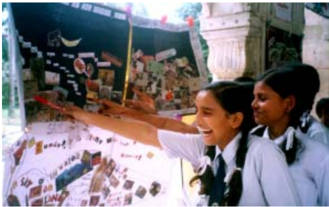
Students joy of learning