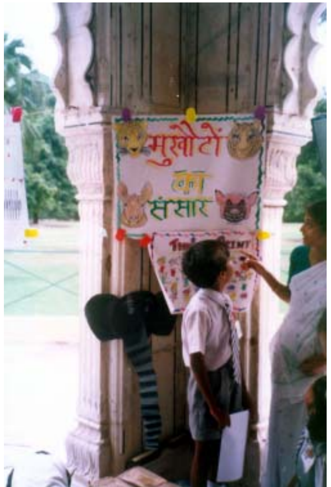
Teacher explaining the poster