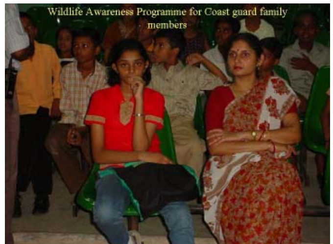
Wildlife awareness programme for Coast Guard family members