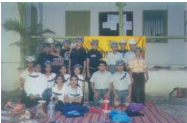
The school children with masks provided by Zoo Outreach Organisation and bat badges prepared by themselves

* General Secretary, International Society of Naturalists, C/o. Oza Building, Salatwada, Vodara 390 001, Gujarat, Email: <insona@123india.com>