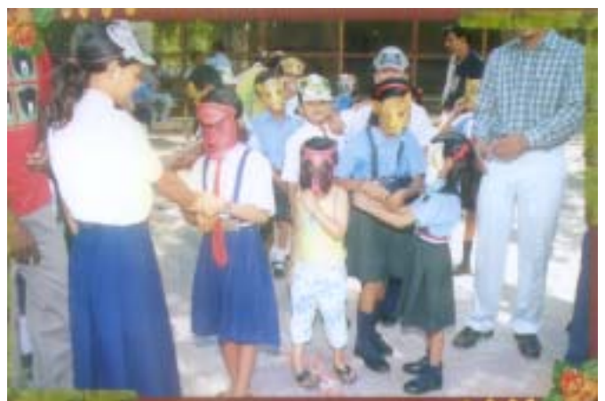
Students tying Rakhies and taking oath to save the wildlife and their habitat