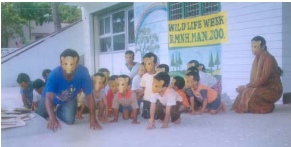
Kids with Tiger masks