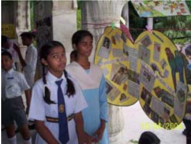
Students displaying models