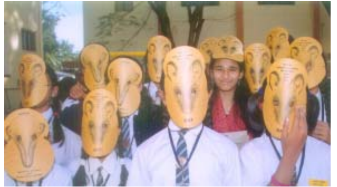
Students with Rat masks