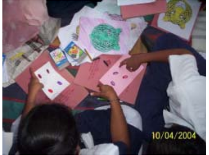
Students displaying models