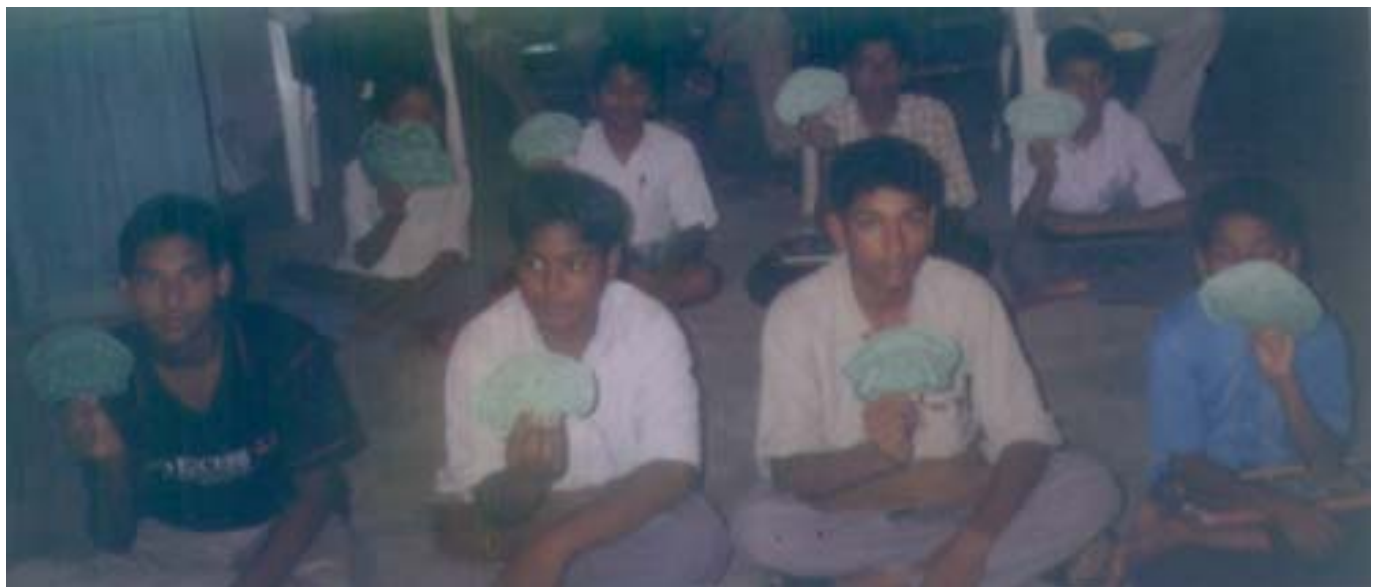
Students Holding educational material during the seminar on Measures for Costal Conservation

* School of Studies in Zoology, Jiwaji University, Gwalior 474 001, Madhya Pradesh, Email: <soszool@rediffmail.com>