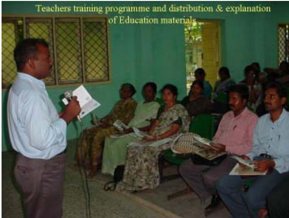
Teacher training programme and distribution & explanation of Education materials