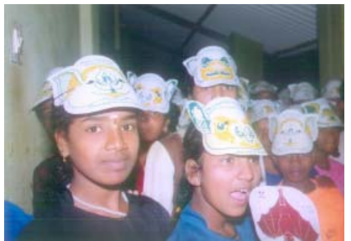
All about bats...