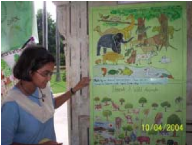
Student displaying poster