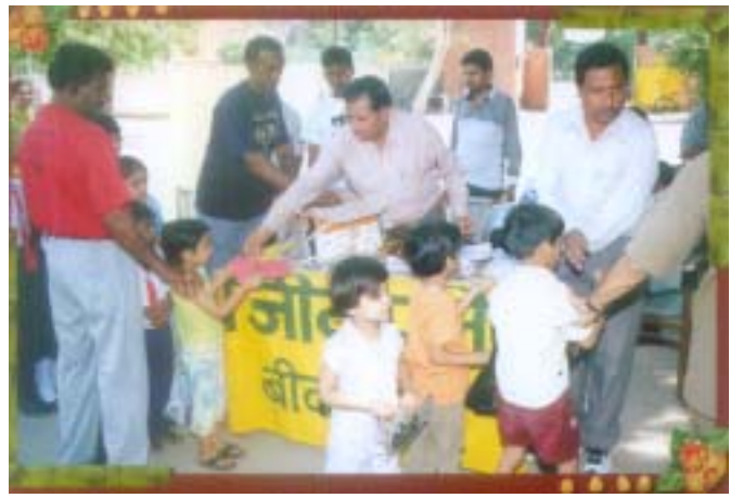
Wildlife warden distributing literature