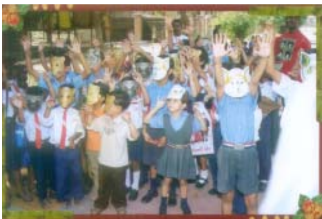
Children with mask demanding safety for there animals and their habitat