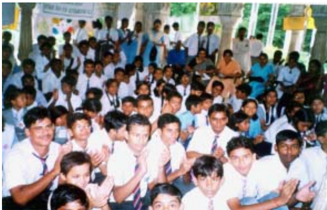
A section of the student participants