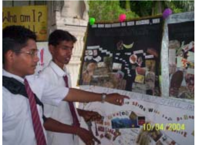
Students explaining models