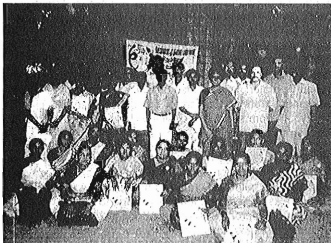
Teacher Training Programme

A three-days camp was conducted at the MCBT premises, between 5 & 7 April for the students from Symbiosis Institute of Mass Communication, Pune. As part of the programme an illustrated talk on Indian wildlife, special talks on wildlife photography and filming in the wild, slide / video shows, field trips to the nearby wilderness area, project work and creative sessions were conducted for the participants. Eight students and one staff participated in the camp. The Education Officer conducted the camp with inputs from the E.E. Coordinator and various other resource persons.