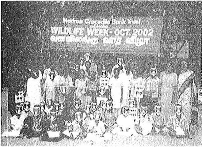
Wildlife Week celebrations

Padur, a village about 9 km south of MCBT was recently included in the EE Ford India project. A tree planting rally was conducted on the 30 November with the enthusiastic support of the village Youth Club. Over 300 students from the Panchayat Union Welfare School, Youth Welfare Association, Padur, and the Hindusthan Engineering College