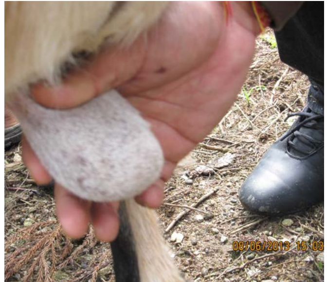
Another example of Cryptorchidism which is the absence of one or both testes from the scrotum.

Discussion: It is a hereditary defect caused by a recessive sex limited gene involving more than one pair of genes. The semen of a mono cryptorchid male may be normal, clear and watery and the sperm concentration is comparatively low, relatively more abnormal with dead sperm cells. In unilateral cryptorchidism there may be impairment of fertilizations (ranging from normal to infertile) and the sexual behavior of a cryptorchid male is normal, coitus in such a male is prompt, hence the case discussed can be assessed as normal unilateral cryptorchidism.