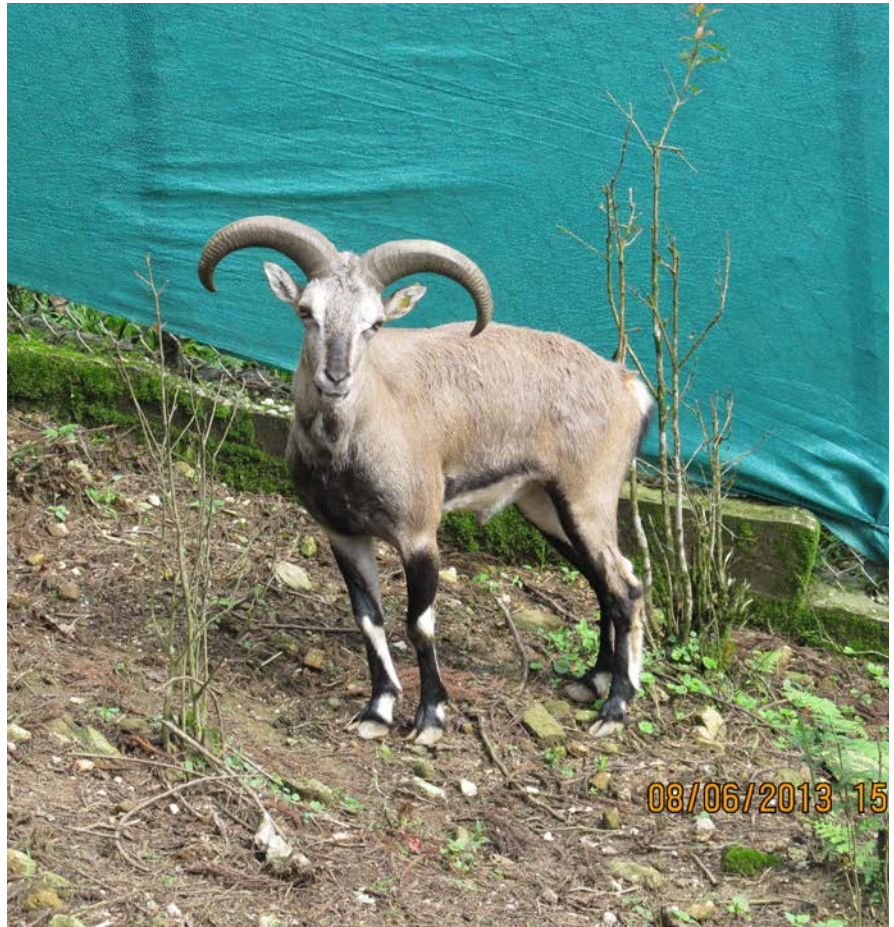
The male blue sheep fawn born to the male...a healthy animal

Introduction: Cryptorchidism is a pathological condition of the testis which denotes an abnormal retention of undescended testicle, which maybe retained within abdominal cavity or inguinal canal. Normally the testis is located in the scrotum at or soon after birth through descent of testes. Cryptorchidism maybe unilateral or bilateral. Unilateral Cryptorchidism (retention of one testicle) is more common and the affected males are nearly normal fertile because of normal production of spermatozoa from the one testis located in the scrotum and is more common. Bilateral cryptorchidism is the