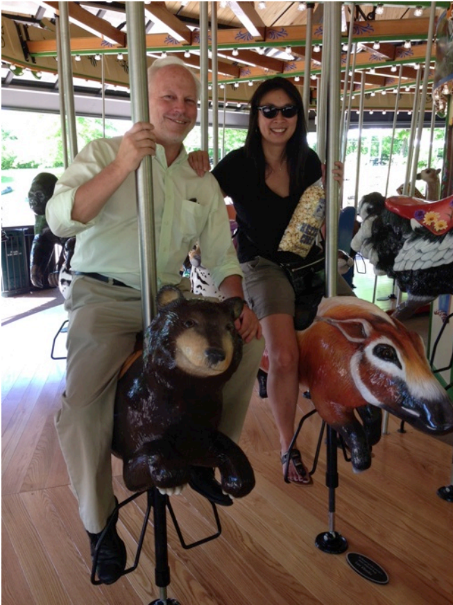
Never too far from wild animals ... dead, alive, sculptured ...zoo people can't resist any of them.

conservation/education-focused zoo in the developing world.