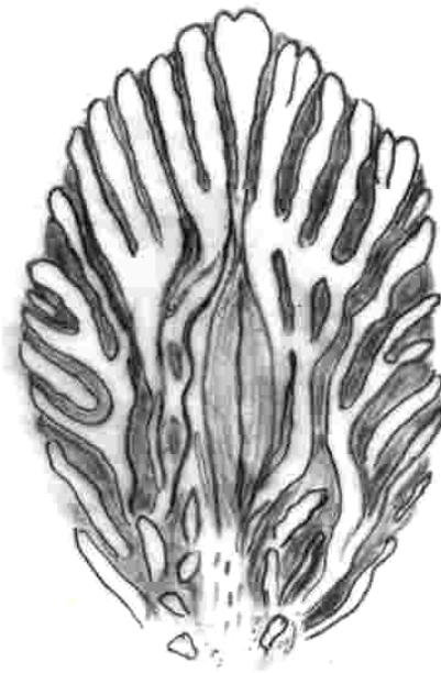
Figure 2. Adhesive apparatus showing median depression

genus Glyptothorax . In both groups, the thoracic adhesive disc appears to be an adaptation to life in fast flowing waters (Hora, 1930; de Pinna, 1996) and probably ensures anchorage on rocks and boulders against the fast flowing water. In Pseudolaguvia with proportion to its body size, the adhesive apparatus looks feebly developed, whereas in Glyptothorax it is prominent as Glyptothorax is bigger in size.