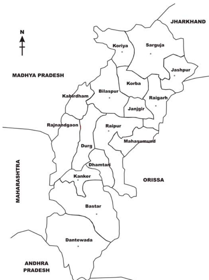
Map of Chhattisgarh showing collection localities

Varshney, R.K. (1994). Index Rhopalocera indica . Part III. Genera of butterflies from India and neighbouring countries (Lepidoptera: (B) Satyridae, Nymphalidae, Libytheidae and Riodinidae). Oriental Insect 28: 151-198.