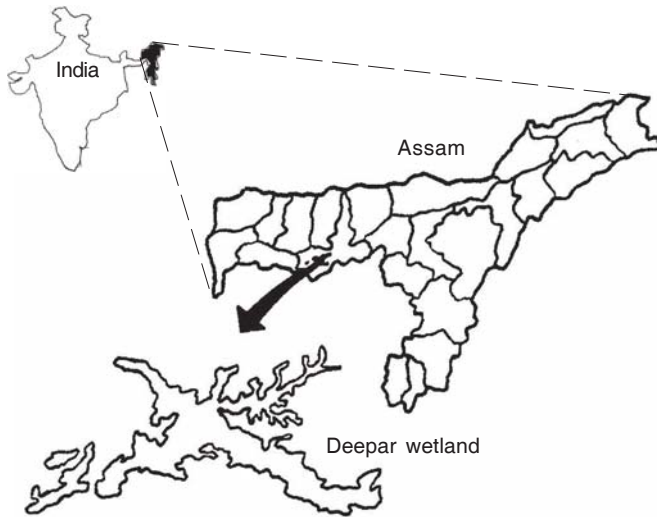
Figure 1. Location map of Deepar wetland

C. lineatum occurs at the littoral areas of northern shoreline near Khanajan canal of the wetland along with selective vegetations. The bottom soil texture at its occurring zone is clayey-loam. They are never observed on sandy soils of main